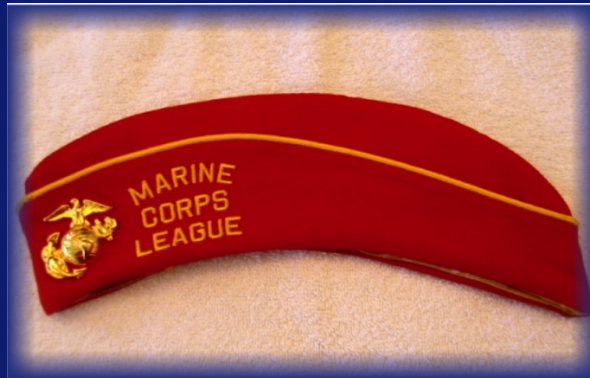
The Female Cover