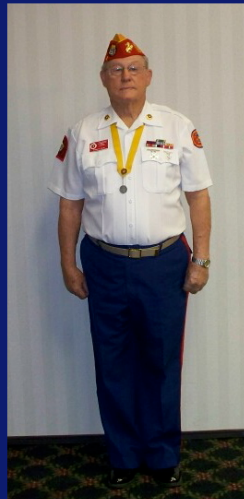
Blue Trousers with Red NCO Stripe